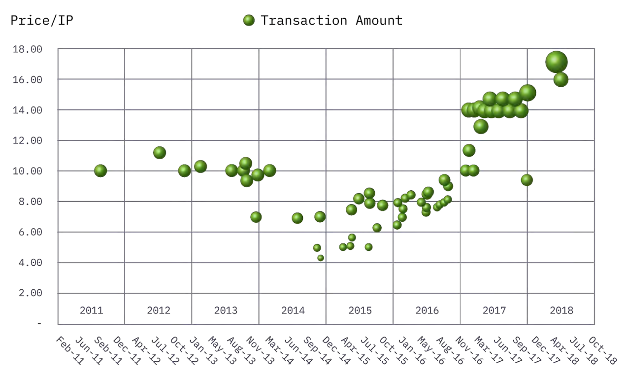
Data supplied by IPv4 Market Group